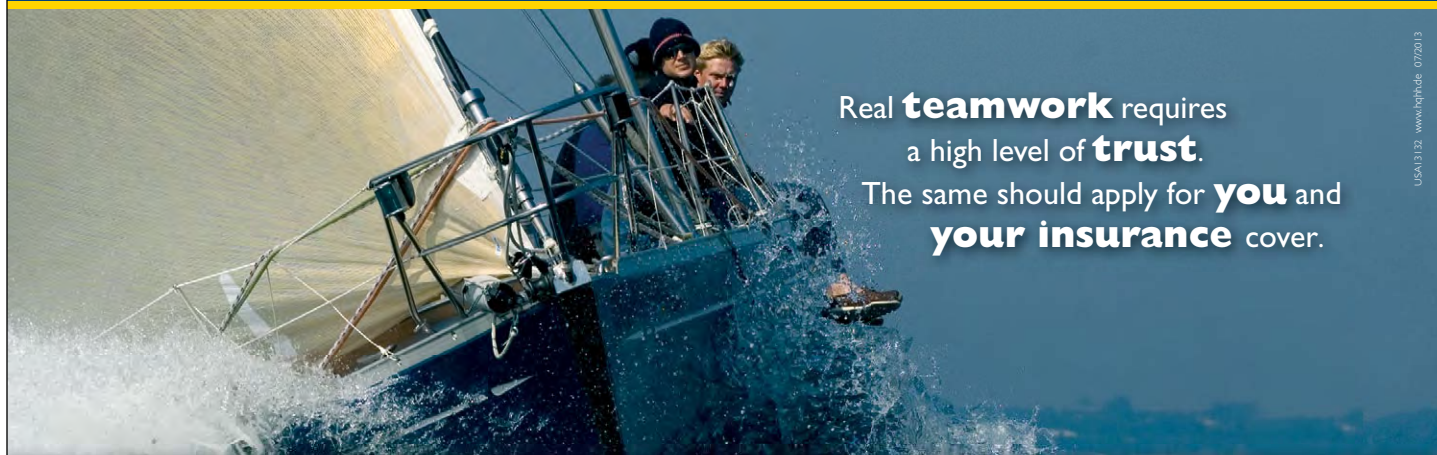
USA1312Z www.pantaeenius.com 07/2013