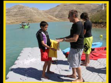
Clinic & Barefoot Show Lebanon 2013