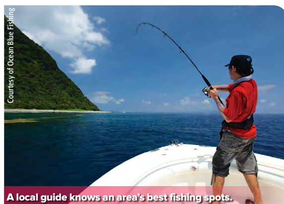
A local guide knows an area's best fishing spots.

“My work begins well in advance of the trip,” says